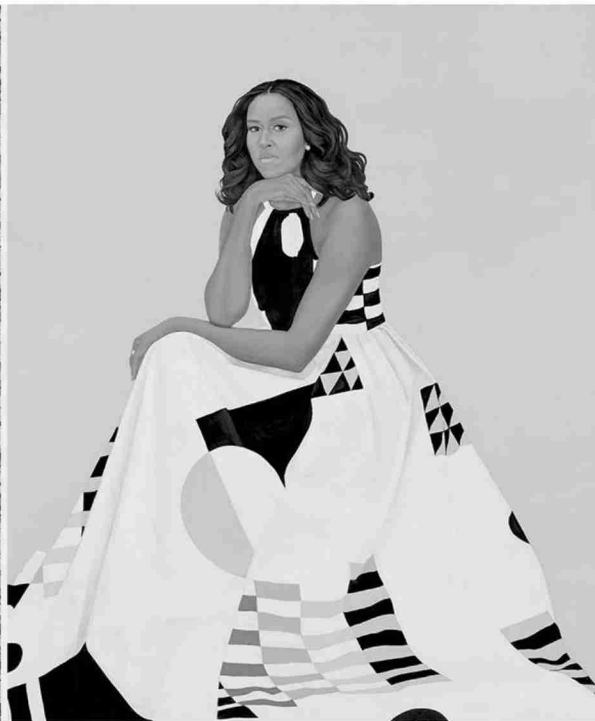
ARTWORKS BY KEHINDE WILEY, LEFT, AND AMY SHERALD, RIGHT